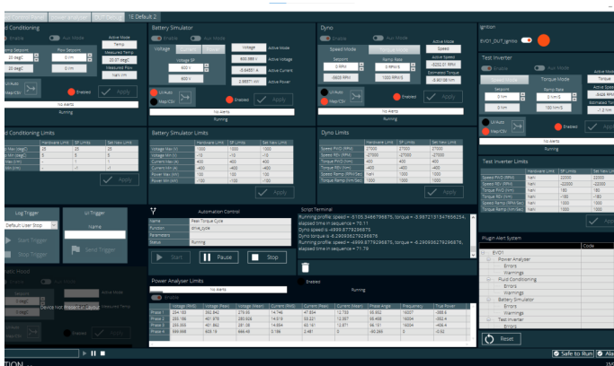
TYPICAL USER INTERFACE

Please contact our team to discuss your test requirements or arrange a demonstration.